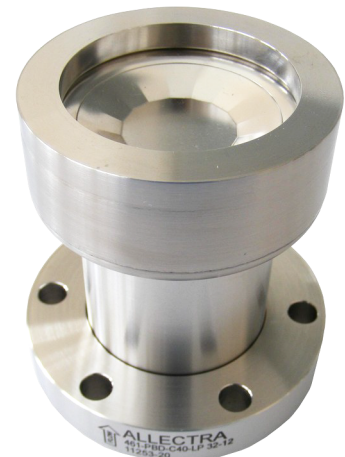
Pressure Burst Disc low pressure version on 40CF