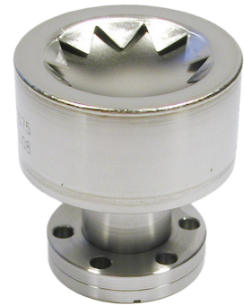
Pressure Burst Disc standard version on 16CF