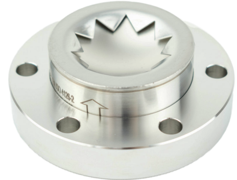
Pressure Burst Disc standard version on 40CF

DN40CF and DN16CF versions / KF types and custom flanges, ULP version needs 63CF or ISO63 flange