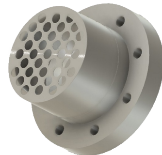
The Ultra Low Pressure Burst Disc with a rupture pressure below 0.5 bar on 63CF flange. With this component, the overpressure regulations do not apply for the system. Mesh cover to prevent accidental damage to the membrane

File: 461-PBD-3-versions-E Last revised 2020-08-06-ED-TW All data given in this sheet is carefully checked but subject to change at any time.