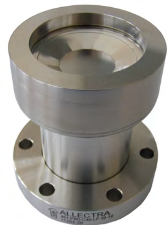
Pressure Burst Disc low pressure version on 40CF