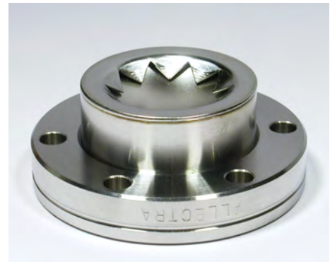
Pressure Burst Disc standard version on 40CF

All data given in this sheet is carefully checked but subject to change at any time.