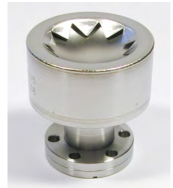
Pressure Burst Disc standard version on 16CF