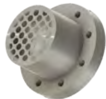
The Ultra Low Pressure Burst Disc with a rupture pressure below 0.5 bar on 63CF flange. With this component, overpressure regulations do not apply for the system. Mesh Cover to prevent accidental damage to the membrane