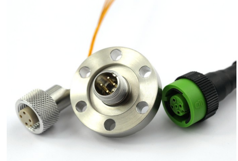
Complete Set: UHV connector, feedthrough on CF16 flange and air side connector

Allectra offers this type now as a UHV feedthrough including UHV compatible connectors. For less demanding applications, HV and standard connectors can be used on both sides.