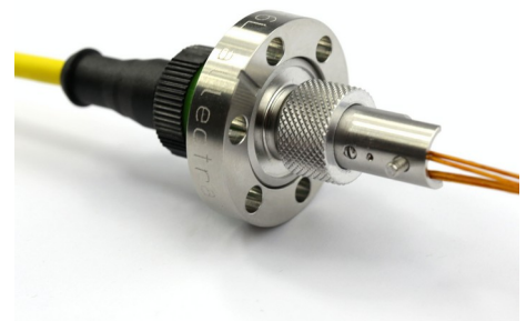
M12 feedthrough, seen from the vacuum side, with connectors. The UHV connector has a reduced OD, so it fits through a DN16 flange