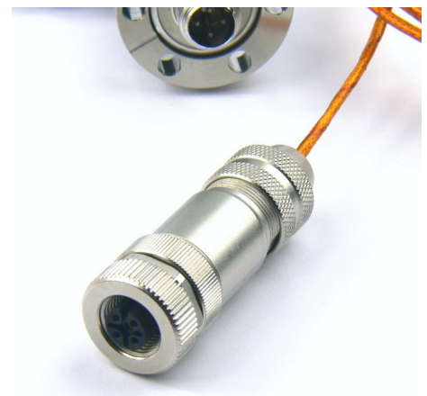
Connector for High Vacuum use, down to 10^{-6} mbar