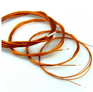
Various samples of radiation resistant wires, including 50 Ohm coaxial cable