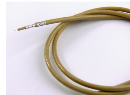
Triaxial PEEK insulated cable Type 310-PEEK50-TRIAX 50 Ohm impedance